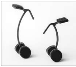
Wedge style ear hook: Adult and child size