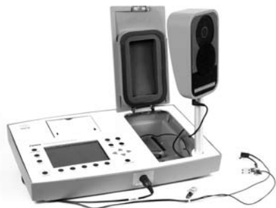
FONIX FP35 Hearing Aid Analyzer