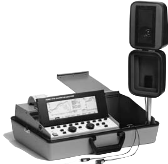
FONIX FP40 Hearing Aid Analyzer