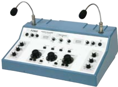
FONIX FA-10 shown with optional gooseneck microphones