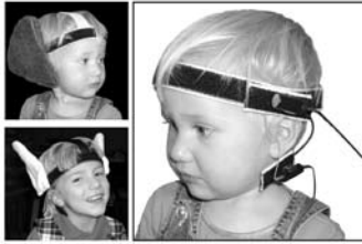
Infant/Child Headband Package