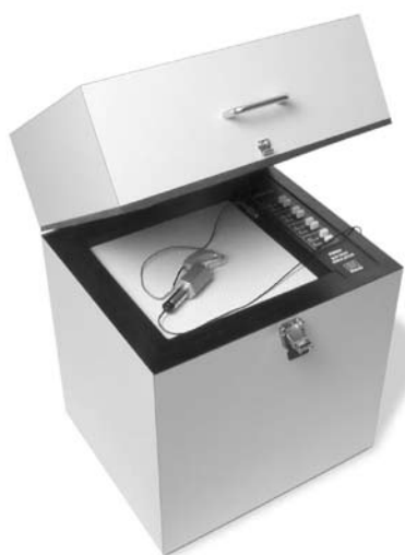
7020 Sound Chamber