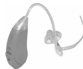
118/45 Next 8 Moda II

Next 8 Moda II is suitable for fitting mild to moderately severe hearing losses and can fit audiogram configurations ranging from reverse to precipitously sloping.